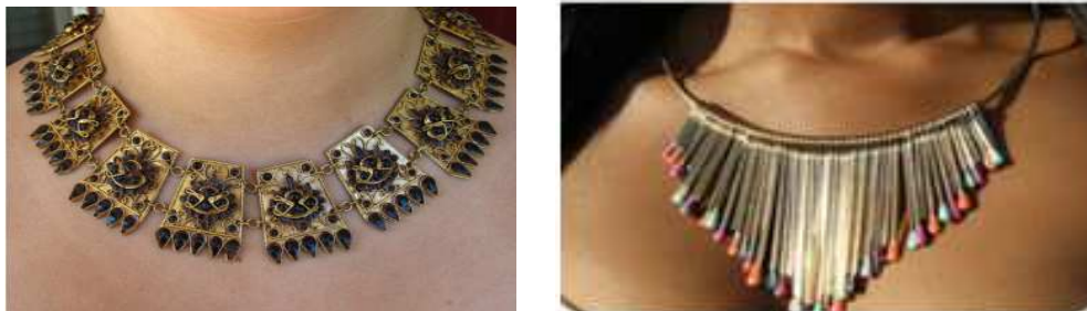
Figure 3. Egyptian jewelry

Each direction has its own set of recognizable features. The Egyptian style corresponds to blue, turquoise, gold and yellow tones. They are combined with black, orange, green and red. The patterns include images of anthropomorphic gods, supernatural beings, pharaohs, pyramids, scarab beetles, as well as geometric motifs, hieroglyphs and a lotus. The material of clothing is very diverse – it is fur, wool, leather, velour, linen, silk. Accessories – metal plates, fringe and embroidery.