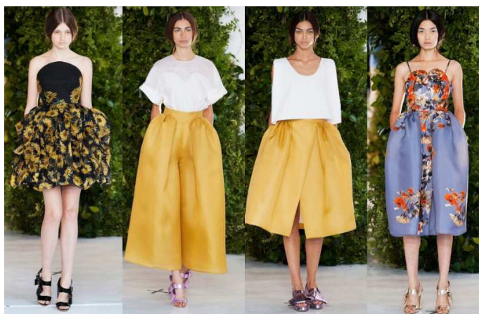
Figure 5. Egyptian ethno-style involves the use of natural colors

The main rules that designers adhere to when creating clothes – giving maximum comfort and naturalness. For the first time, the ethnic style of clothing was promoted among hippies. Hippie style in clothing is not just an image, it is a whole philosophy of life.