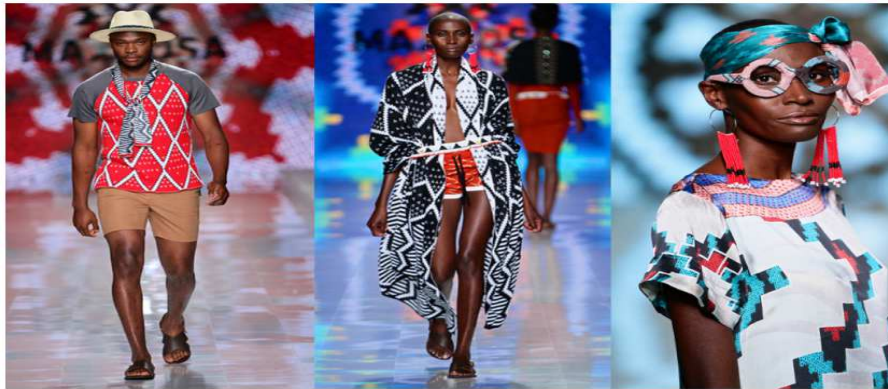
Figure 2. Ethnic style of Africa

Each direction has its own set of recognizable features. The Egyptian style corresponds to blue, turquoise, gold and yellow tones. They are combined with black, orange, green and red. The patterns include images of anthropomorphic gods, supernatural beings, pharaohs, pyramids, scarab beetles, as well as geometric motifs, hieroglyphs and a lotus. The material of clothing is very diverse – it is fur, wool, leather, velour, linen, silk. Accessories – metal plates, fringe and embroidery.