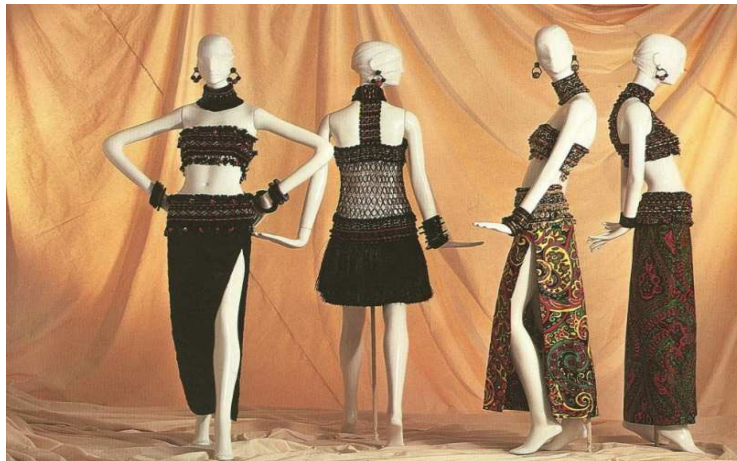
Figure 1. Ethnic style by Yves Saint Laurent

Ethnic style in clothing first surprised from the catwalk in the 10s of the XX century. It was then that the famous designer P. Poiret showed the whole world an extraordinary collection of clothes in the East Asian style. As some say, it was the ballet Scheherazade that inspired his ethnic style.