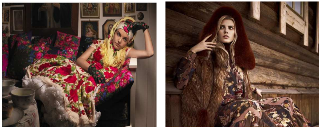
Figure 7. Russian style in clothing embodies wealth and beauty

Russian traditional clothing occupies a special place in the hearts of designers, especially for the abundant use of embroidered elements, buttons and colorful motifs. The choice of fabrics is full of variety: silk, linen, cotton, satin and velvet, cloth and even lace, which were additionally decorated with embroidery, beads, numerous stones, fur inserts and fringes.