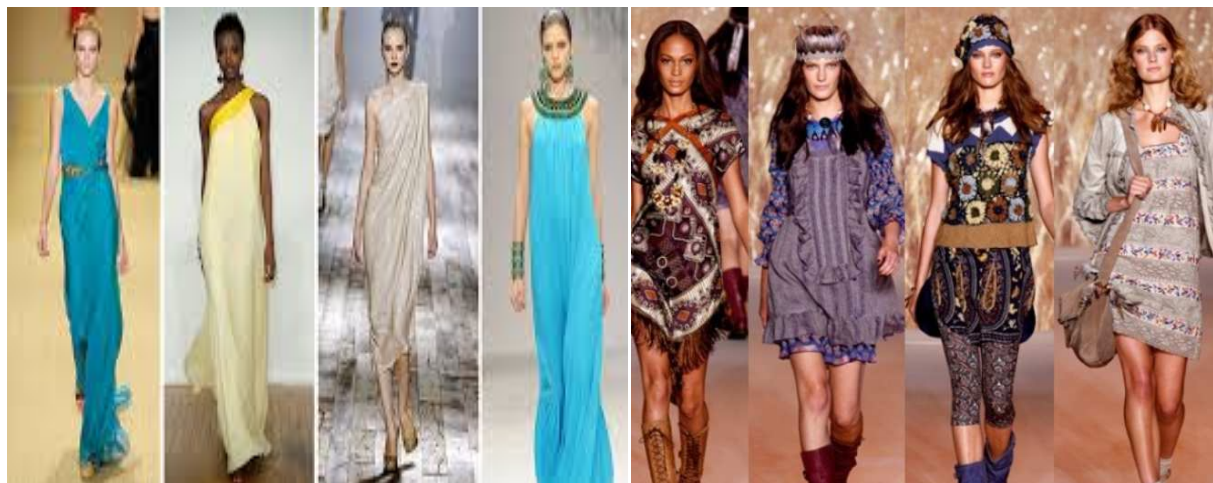
Figure 4. Classical folk clothing of various countries (India, Russia, Egypt, Greece, etc.) is increasingly used to create modern collections and fashionable bows.

Hairstyle-straight hair of medium length and thick bangs. The clothes of many designers here and there hide echoes of the mysterious Ancient Egypt. First of all, this is expressed in a certain color scheme: white, blue, gold, turquoise and yellow. The Egyptian ethno style practically does not limit the choice of fabrics. Here you can safely choose linen, silk, fur and wool, leather and suede. And of the decorative elements, metal plates, embroidery and fringe are preferred.