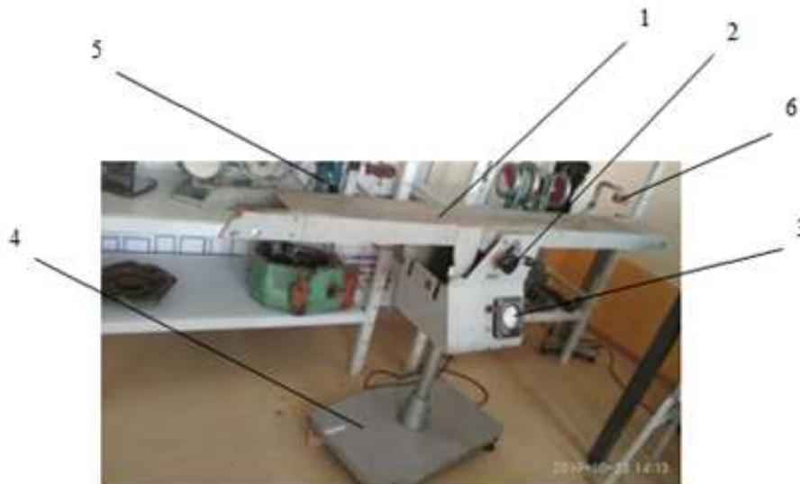
Figure 1. Device for determining the coefficient of friction

To do this, the device shown in Figure 1 was used. This device consists of a base 4, an adjustable bevel 1, a stopwatch 3, sensors 5, 6 and a handle of the turning mechanism 2.