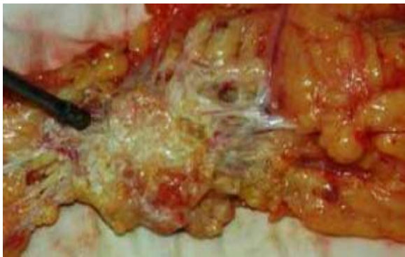
Picture 3. Ovarian cancer metastasis in a greater omentum of large size. Angiogenesis around metastasis is pronounced