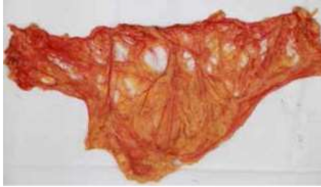
Picture 1. Large triangular-shaped omentum seal with uniform fat filling (norm)

Histological examination was carried out on paraffin sections and film preparations stained with hematoxylin and eosin [20-28]. The preparations were studied and photographed under the mVizo-103 microvisor microscope and the MICROMED 3 microscope with the DTM 510 camera.