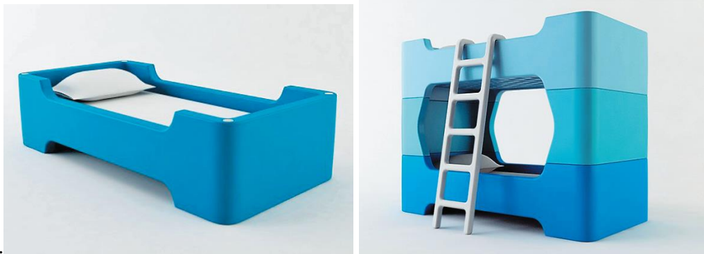
Figure 2. Children's furniture Toddler Tower ("Baby Tower"). The Designer Is Mark Newson. UK. 2011

3. The specialization of the form occurs as a result of taking into account its interactive development by the consumer. Using modular solutions, a person understands only the elements he understands and builds them according to his needs. This leads to a high level of rationality of the design and, in turn, ensures the individualization of forms. An example of this is the multi-module furniture collection of the Italian studio Heyteam, in which not only shapes, but also color serve as instructions for the user (Fig. 3). The simplicity of the shapes may not personalize this project enough. Together with color and taking into account the variety of solutions, they become unique for the consumer, that is, in the process of interactive interaction with the object.