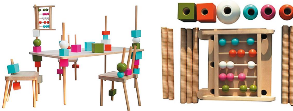
Figure 4 children's furniture. The Designer Is Maria Wang. Sweden.2008

4. The ability to creatively "live" a modular form through interactivity is often a theme for children and teenagers. This aspect can be considered in the example of Swedish designer Maria Wang's children's furniture (Fig. 4), which offers a set of modules (constructor) as a starting point from which you can assemble children's furniture or any other compositions. The boundaries of the formation are defined by the designer, within which the consumer can change and sort the forms.