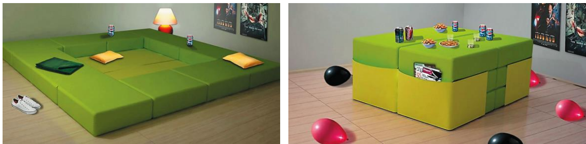
Picture 3 modular furniture Multiplo. Design: Heyteam studio. Italy. 2010

3. The specialization of the form occurs as a result of taking into account its interactive development by the consumer. Using modular solutions, a person understands only the elements he understands and builds them according to his needs. This leads to a high level of rationality of the design and, in turn, ensures the individualization of forms. An example of this is the multi-module furniture collection of the Italian studio Heyteam, in which not only shapes, but also color serve as instructions for the user (Fig. 3). The simplicity of the shapes may not personalize this project enough. Together with color and taking into account the variety of solutions, they become unique for the consumer, that is, in the process of interactive interaction with the object.