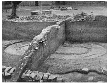
Elliptic plan of the Temple

Excavation of the huge Temple of Vāsudeva next to the Heliodorus pillar