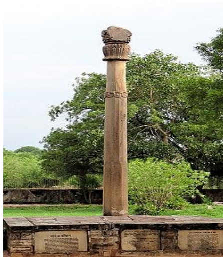
The Heliodorus pillar in Besnagar

The Heliodorus pillar is a stone column that was erected around 113 BCE in central India in Besnagar (near Vidisha, Madhya Pradesh). The pillar was called the Garuda-standard by Heliodorus, referring to the deity Garuda. [5,6]