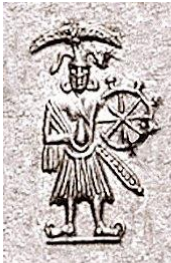
The deity to whom the Heliodorus pillar was dedicated: Vāsudeva

the coinage of Agathocles of Bactria circa 190-180 BCE, which shows that he was already widely considered as a deity by that time, and probably as early as the 4th century according to literary evidence. In the Heliodorus pillar, Vāsudeva-Krishna was worshipped as the "God of Gods", the Supreme Deity. At one point Vāsudeva-Krishna came to be associated to the God Narayana-Vishnu. Epigraphically, this association is confirmed by the Hathibada Ghosundi Inscriptions of the 1st century BCE. It is thought that "by the beginning of the Christian era, the cult of Vasudeva, Vishnu and Narayana amalgamated". As a third step, Vāsudeva-Krishna was incorporated into the Chaturvyūha concept of successive emanations of the God Vishnu. By the 2nd century CE, the "avatara concept was in its infancy", and the depiction of Vishnu with his four emanations (the Chaturvyūha) starts to become visible in art at the end of the Kushan period.[24]